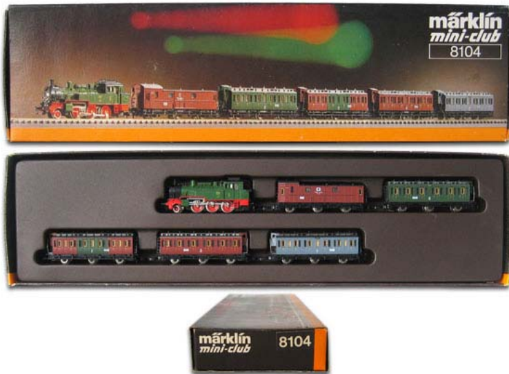
8104 – Prussian Railroad Passenger Train

Contents: 1 class T 12 tank locomotive, 1 baggage car, 1 compartment 2nd class, 1 compartment car 2nd/3rd class, 1 compartment car 3rd class and 1 compartment car 4th class. Locomotive and cars in special version.