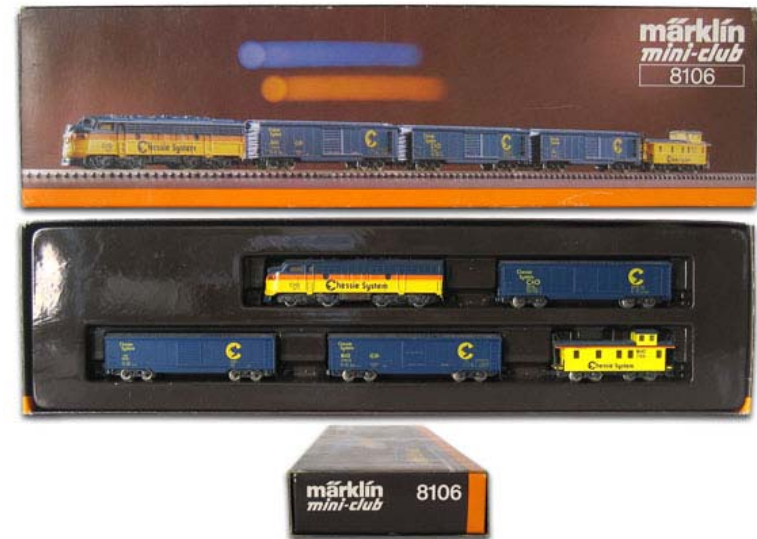
8106 – Chessie System Freight Train

Contents: 1 class T 12 tank locomotive, 1 baggage car, 1 compartment 2nd class, 1 compartment car 2nd/3rd class, 1 compartment car 3rd class and 1 compartment car 4th class. Locomotive and cars in special version.