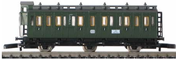
8705.1 – Prussian Compartment Car of the German Federal RR (DB) Former B3-pr03 with brakeman's cab. (qty 2)