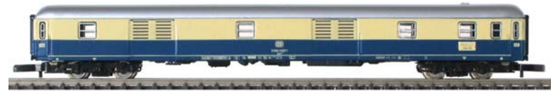
8722 – Express Train Baggage Car (qty 3) Dm 902