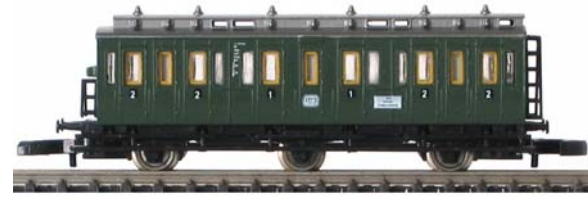
8704.1 – Prussian Compartment Car of the German Federal Railroad (DB) Former BC3-pr03. (qty 2)