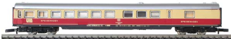
8726 / 8736 – TEE Dining Car (qty 2) Wrm. - with interior lighting