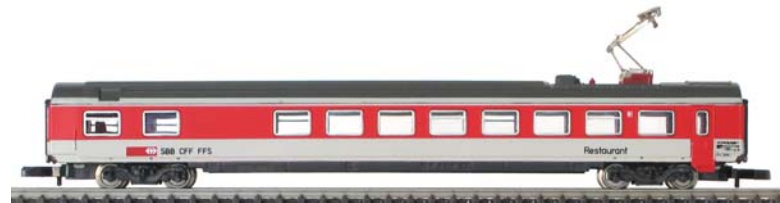
8747 – Express Train Dining Car Standard design Mark IV WR.