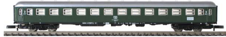
8711 – Express Train Passenger Car (qty 3) Bm 234. 2nd class