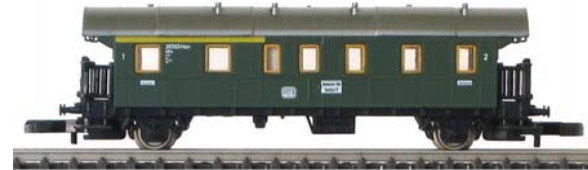
8750.2 – Passenger Car ABi 29. 1st and 2nd class.