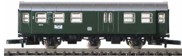
8708 – Rebuild Passenger Car of the German Federal Railroad (DB) BD3yge with baggage compartment. 2nd class.