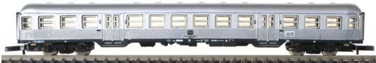
8716 – Commuter Car (qty 3) Bnb 719. 2nd Class.