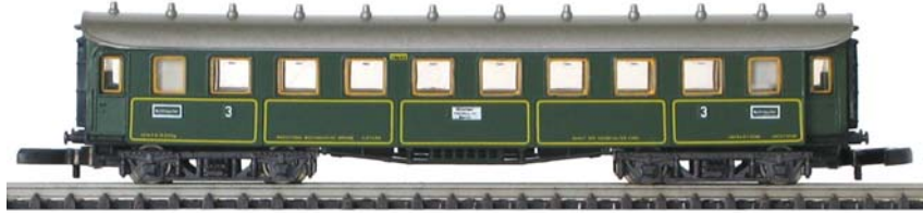
8730 – Express Passenger Car CCü. 3rd class.