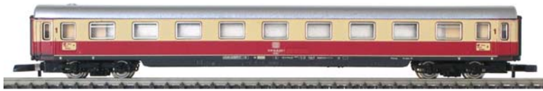
8724 / 8734 – TEE Compartment Coach (qty 4) Avm. - 1st class – without / with interior lighting