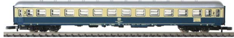
8721 – Express Train Passenger Car (qty 6) Bm 234. – 2 nd class