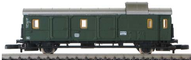
8752 – Baggage Car D2ie.