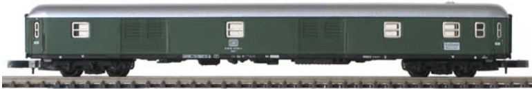
8712 – Express Train Baggage Car (qty 2) Dm 902