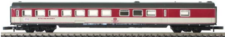
8723 – Express Dining Car (qty 4) WR uem