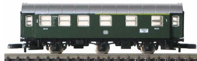
8706 – Rebuild Passenger Car of the German Federal Railroad (DB) AB3yge. 1st and 2nd class. (qty 2)