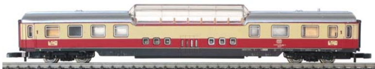
8728 / 8738 – TEE Dome Car (qty 5) Adm. Transparent observation dome – without / with Interior lighting.