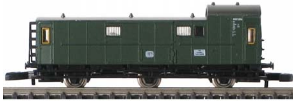
8703.1 – Prussian Baggage Car of the German Fderal Railroad (DB) Former Pw3-pr02.