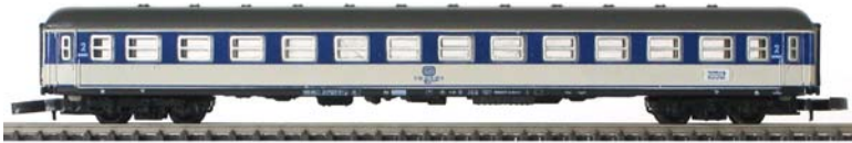
8721.1 – Express Train Passenger Car - variation 1 Bm 234. – 2 nd class