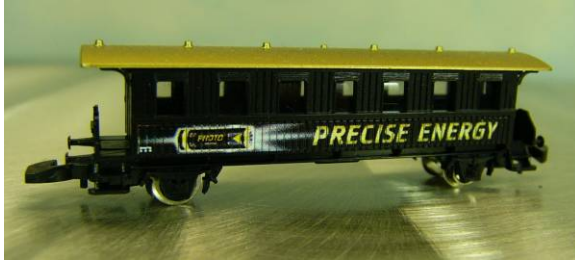
???? – Passenger Car Varta. Precise Energy