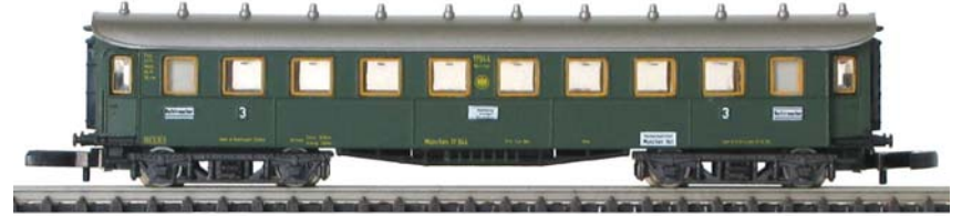
8731 – Express Coach (qty 3) C4ü bay 11. 3rd class.