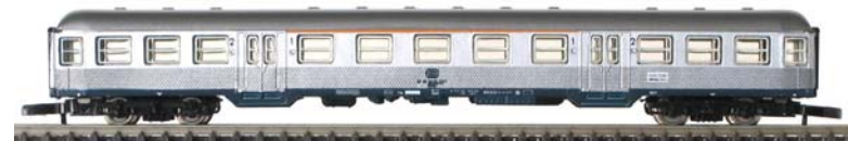
8717 – Commuter Car (qty 3) ABnrzn 704. 1st and 2nd class.