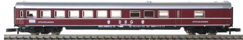
8713 – Express Train Dining Car (qty 2) WRmh 132