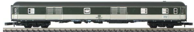
8722.2 – Express Train Baggage Car Dm 902