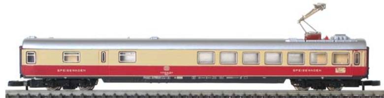
8737 – TEE/IC Dining Car (qty 2) German Federal Railroad type WRmz 135 – with interior lighting.