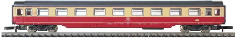
8740 – Express Coach German Federal Railroad type Avmz 207 (A9 EUROFIMA) 1st class.