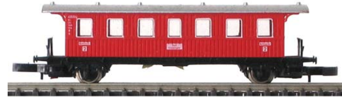
8701.3.1 – Württemberg Provincial Railroad Passenger Car (qty 2)