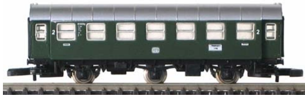
8707 – Rebuild Passenger Car of the German Federal Railroad (DB) B3Yge. 2nd class.