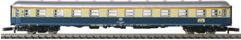
8720 – Express Train Passenger Car (qty 2) AM 203. – 1 st class