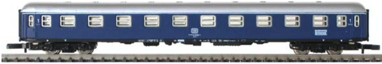
8710 – Express Train Passenger Car (qty 2) AM 203. 1 st class