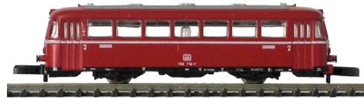
8817 – Railbus Trailer (qty 3) German Federal Railroad class 998.