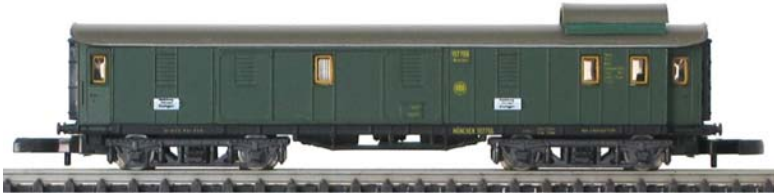
8732 – Express Baggage Car Pwü bay 09.