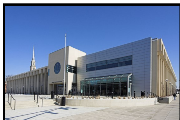
The Allen County Public Library in Fort Wayne, Indiana