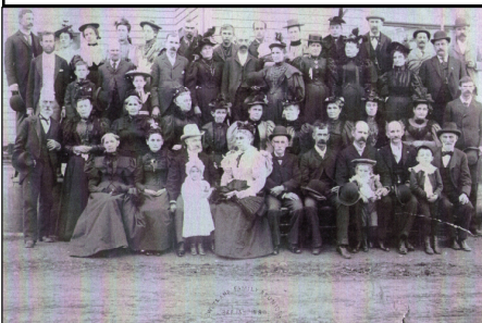
First SFA Reunion, 1896