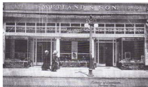
Swetland's Sweet Shop in Portland, OR