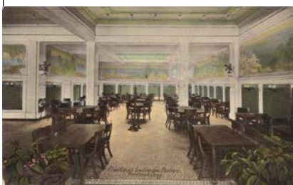
Sweet Shop Interior