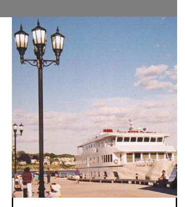
Pier at New London