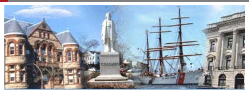
NEW LONDON, CONNECTICUT