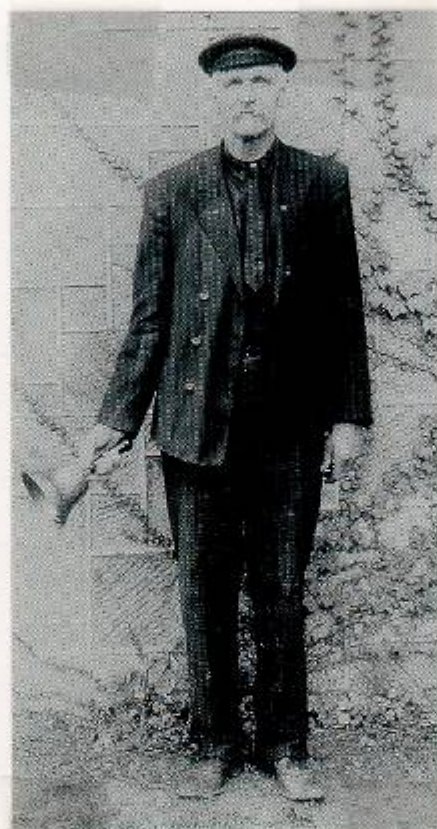
See article to the right.

We will miss you if you don't come. Please don't disappoint us if it is at all possible to be with us at the St. Elmo Hotel. Remember -the cruise is 5:00 PM Friday and the meeting starts at 8:30 AM Saturday.